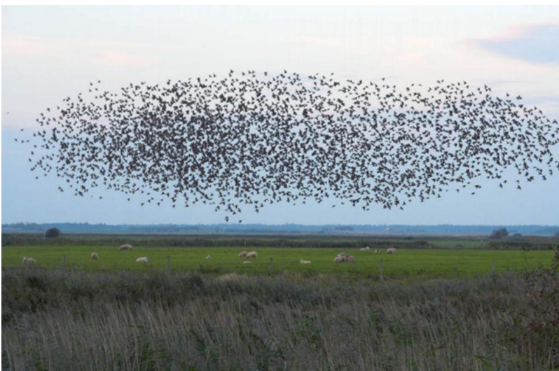
A flock of common starlings in flight (photo by Sabine Jensen/NatuVision.com).

Property, industry and infrastructure can be seriously damaged when starlings use manmade structures as roost and nest sites. Work areas become unsafe and unpleasant for people and considerable cost is incurred to remove starling wastes.