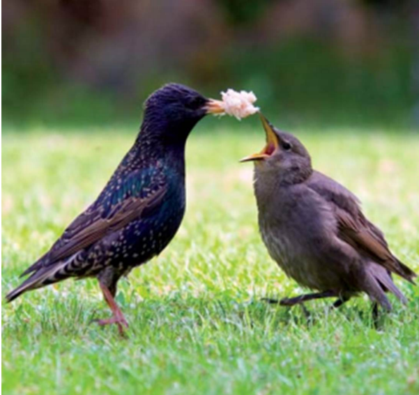
Common starling feeding a youngster.

when they moult to adult plumage in autumn they have a patchy brown and black appearance, often with some pale spotting.