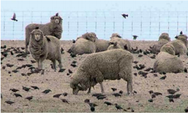
Common starlings feeding among stock in eastern Australia.